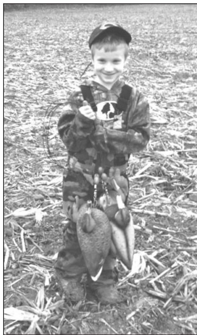
Josh picking up decoys.

BERGMAN HOUSE BED & BREAKFAST will be closing for winter on January 1st 2017 until April 1st 2017 Free gift with booking in December 2016 Call 513-205-9113