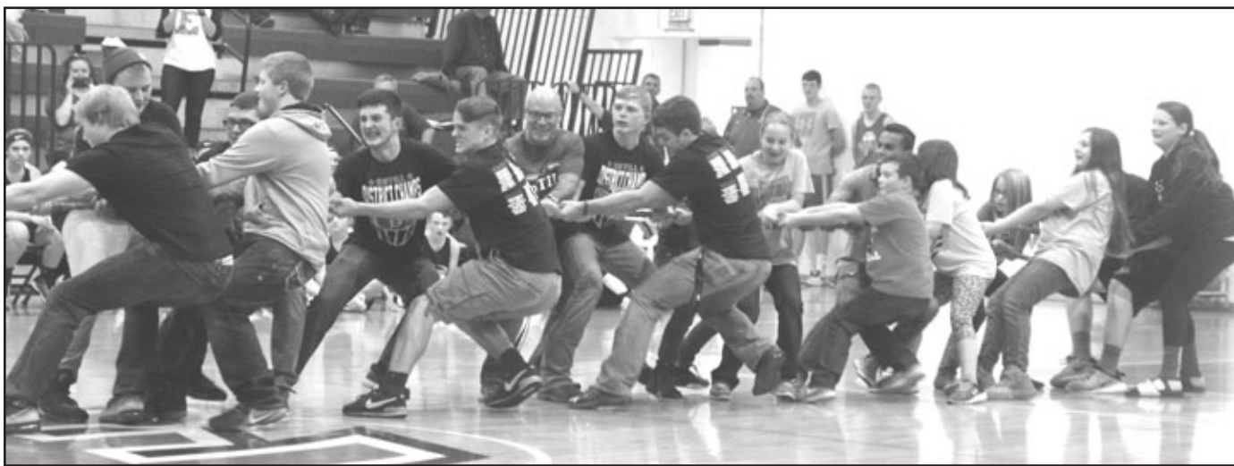
A friendly game of Tug of War brought boys and girls of all ages onto the gym floor at the Estill County High School on Friday night.

ECCHS offers many dual-credit classes, one of which is Dance and Culture through Eastern Kentucky University. A requirement of this course is that all students must view an artistic movement performance. On November 12th, the students pictured were able to attend the Broadway hit STOMP at the Kentucky Center for the Performing Arts in Louisville, KY. Matchboxes, brooms, garbage cans, Zippo lighters and more filled the stage with energizing beats to create the inventive and invigorating stage show that's dance, music, and theatrical performance blended together in one electrifying rhythm. A big thanks to GEAR UP and the Physical Education/Health Department for helping make this experience possible!