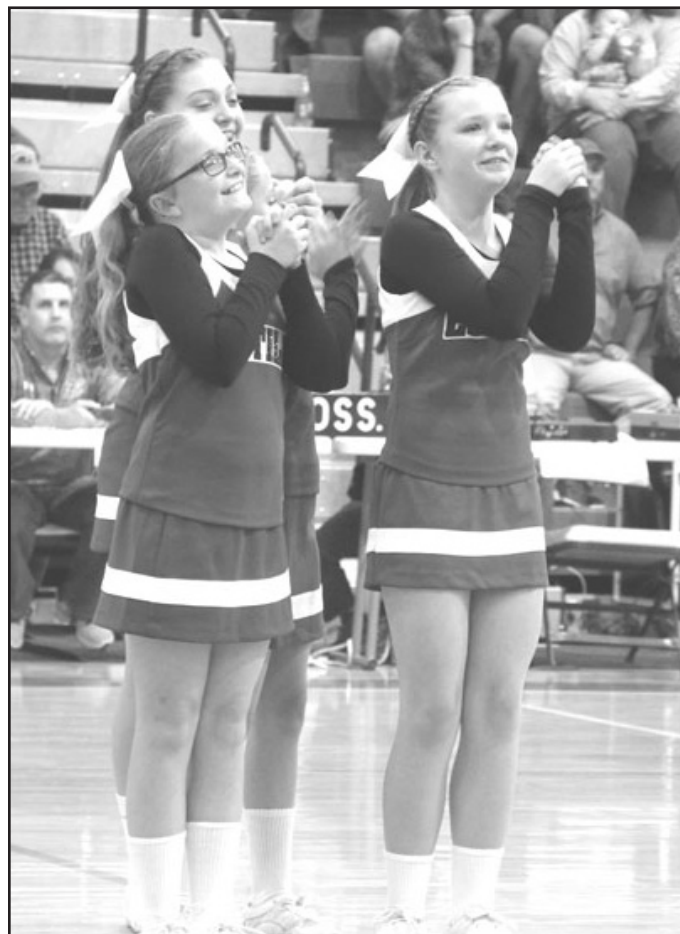
Cheerleaders from the Estill County Middle School performed during Excite Night on Friday night.