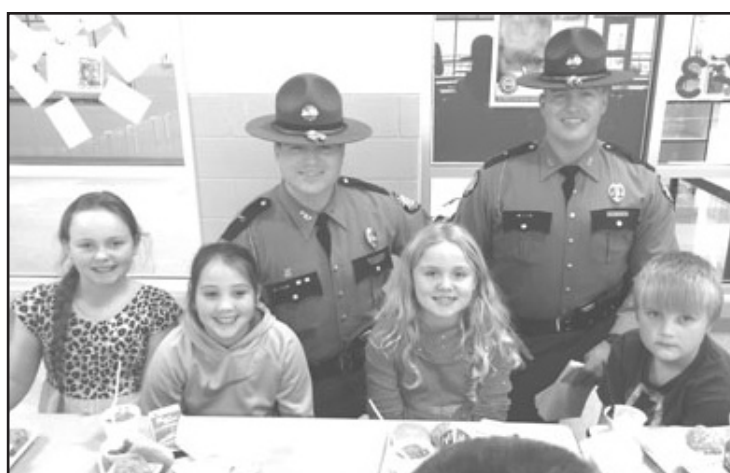
how much we appreciate their service! Students enjoyed meeting the 1st Responders and getting to know more about their careers.