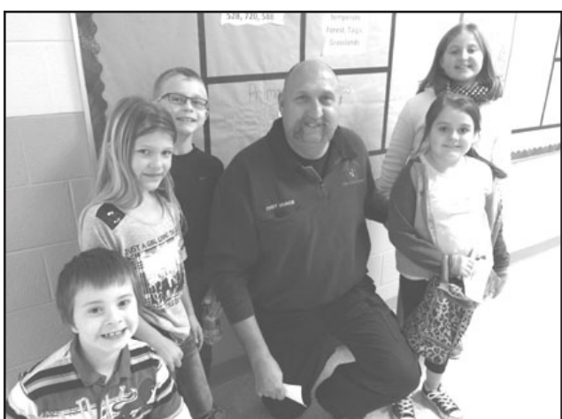
West Irvine Intermediate hosted their annual Thanksgiving Day lunch on Wednesday, November 16. West Irvine Intermediate invited the local 1st Responders of Estill County to attend, so we could show them