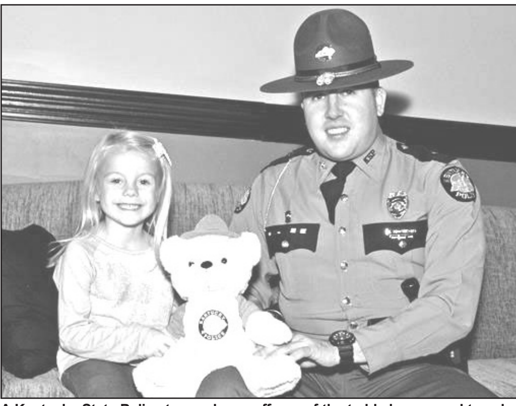
A Kentucky State Police troop shows off one of the teddy bears used to calm children during tramatic situations.

situation such as a car crash, exposure to drugs, or frequently result in the arrest of a parent. KSP hopes their 'Trooper Teddy' bears will serve as a tool to calm innocent children found in these circumstances.