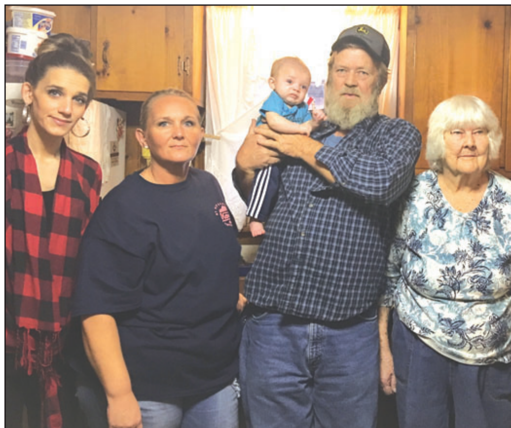
Five Generations of Rucker Family