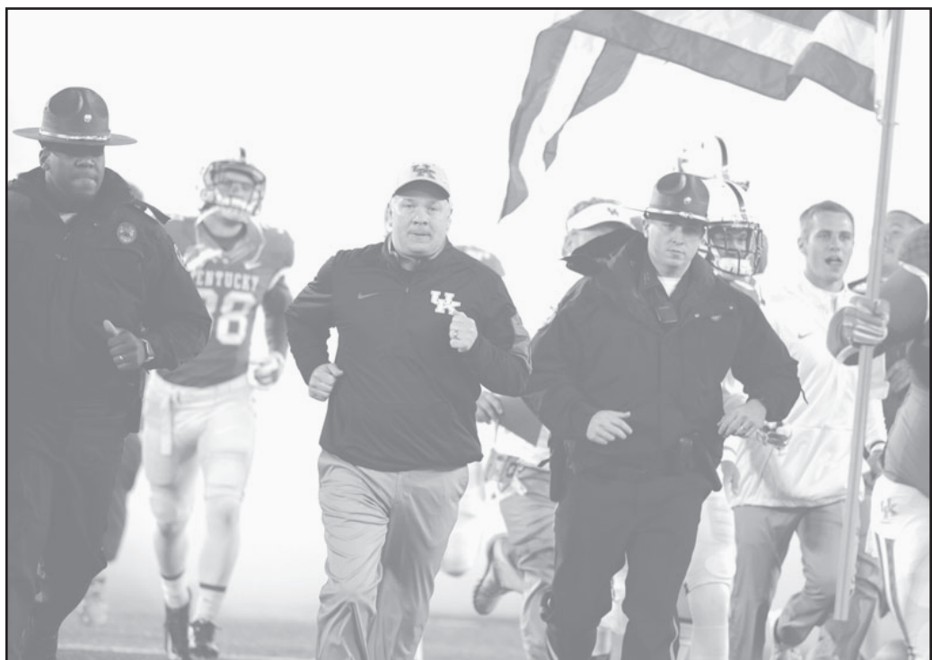
Selected media members believe Mark Stoops could get UK to a bowl game next season primarily because of improvements expected on offense.

There's no way to know what impact Calipari's walk-on offer might have