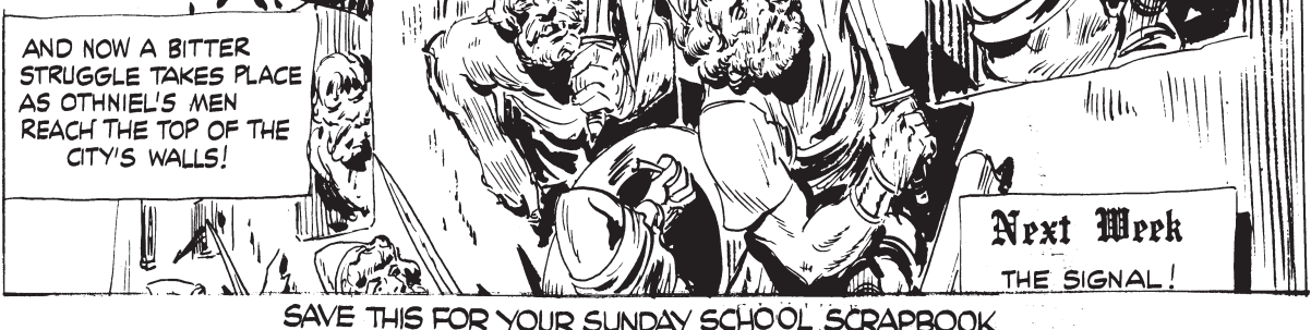
SAVE THIS FOR YOUR SUNDAY SCHOOL SCRAPBOOK

Advertise Here! Call 723-5012 The Estill County Tribune