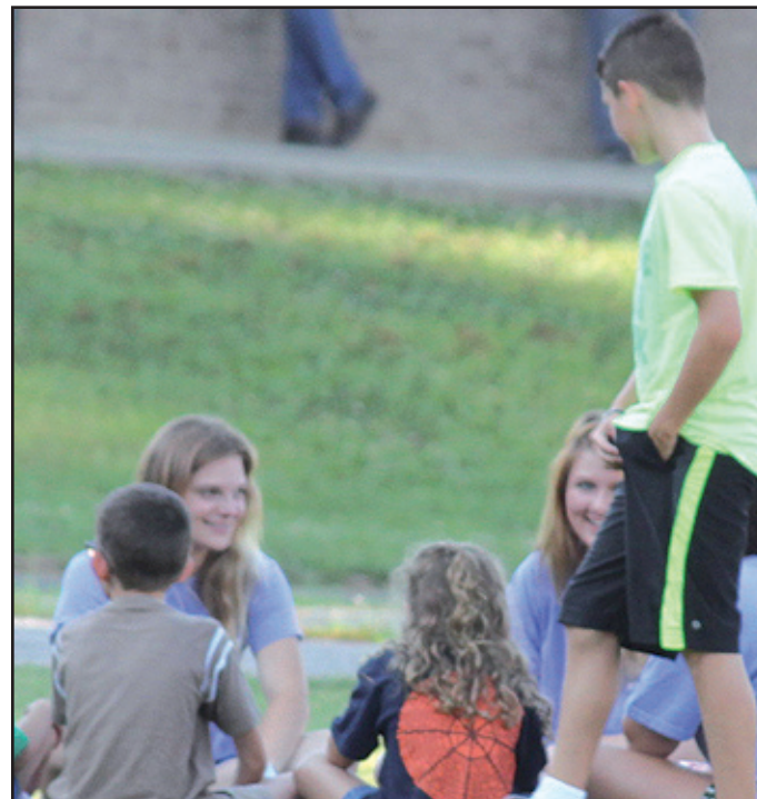
Camp staff from Camp Burnamwood had activities, above, for children during Saturday's rally..

Locally Owned & Operated Serving Estill County For Nine Years!