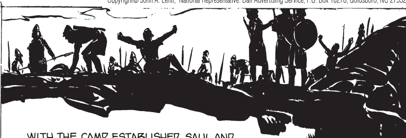
...WITH THE CAMP ESTABLISHED SAUL AND HIS TROOPS PREPARE TO REST FOR THE NIGHT...