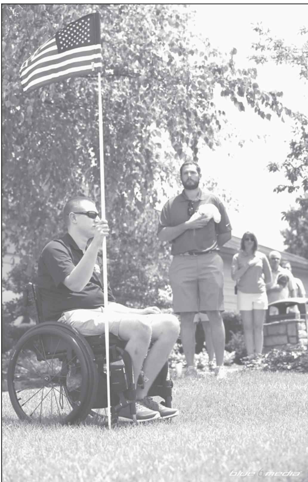
Former UK football standout Jacob Tamme, who now plays for the Atlanta Falcons, and his wife take great pride in Swings for Soldiers Classic, a golf fundraiser they started seven years ago to build specially adapted homes for wounded veterans.