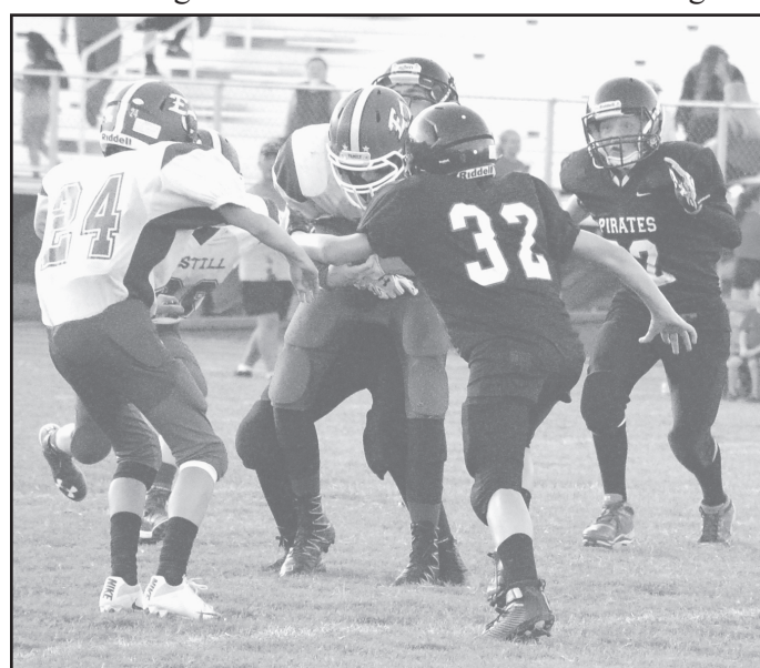
Powell County's defense collapses on the Estill 8th grade ball carrier during action Thursday in Stanton.