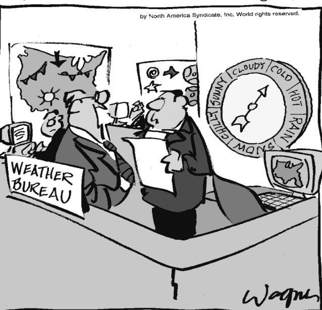
"The others are complaining that you're getting too accurate with your forecasts."