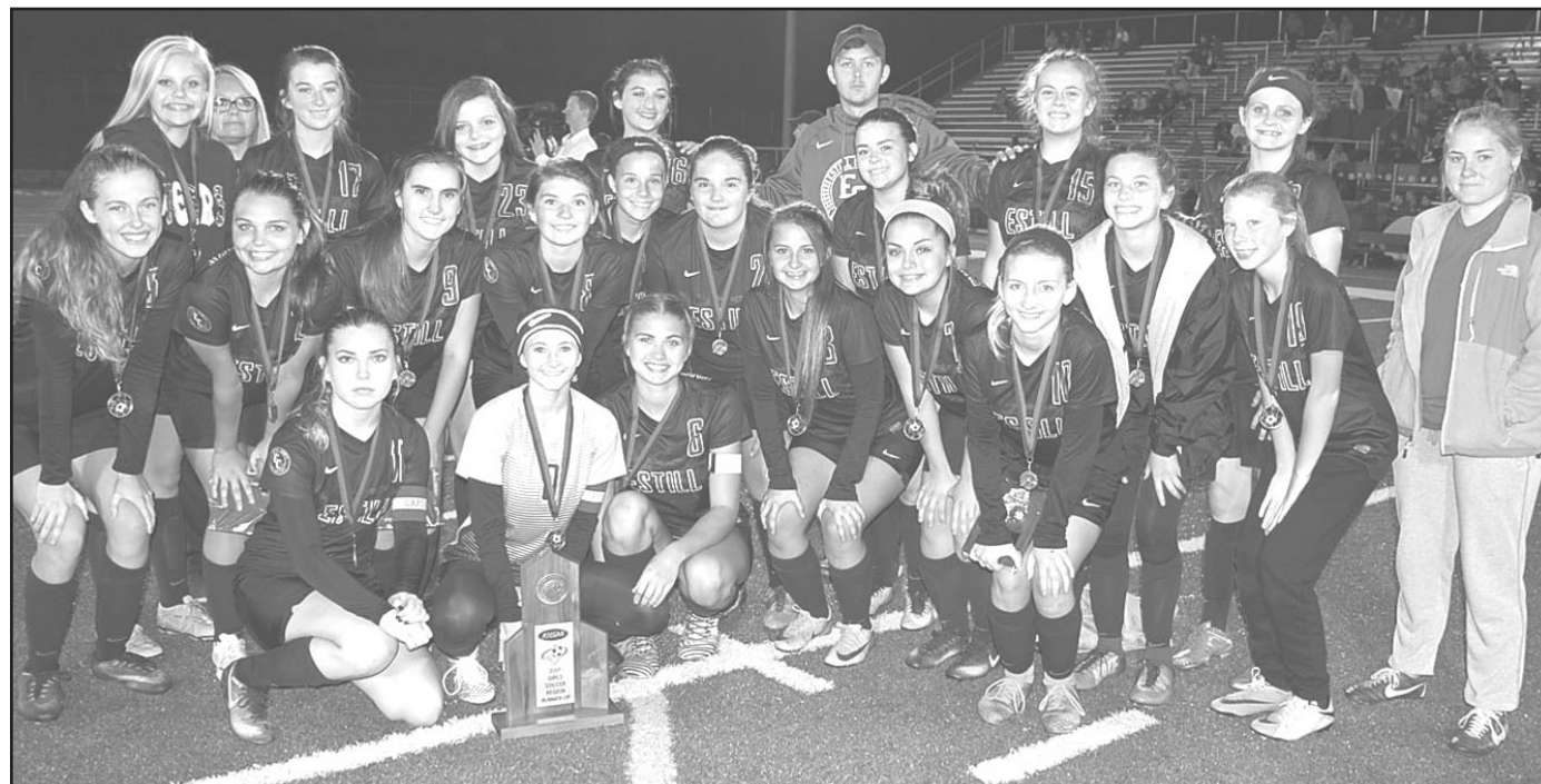
The Estill County Lady Engineers -- 2017 14th Region Soccer Runner-Up

Boys Soccer 12 wins 9 losses D.Beeler- 14 goals- 4 assists, J.Crowe - 13 goals- 10 assists, M.Woolery - 12 goals- 7 assists, M.Rowland- 2.2 GAA.