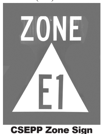
CSEPP Zone Sign

our website www.estillcountytyma.com , find us on FB Estill County EMA/CSEPP, or call us (606) 723-6533.