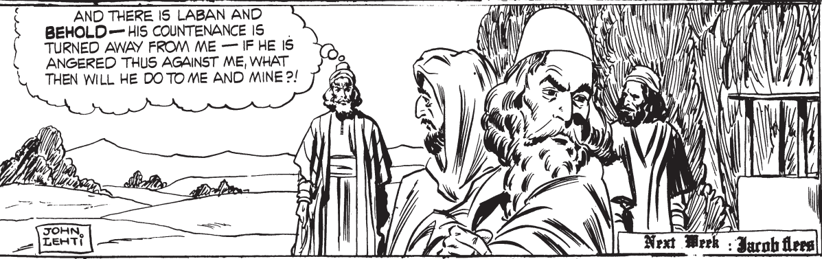
SAVE THIS FOR YOUR SUNDAY SCHOOL SCRAPBOOK