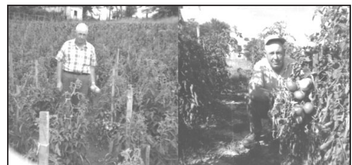
Edgar Rose shown in one of his "early" tomato crops.

The tomatoes required a significant amount of work. After the land was plowed and harrowed, the hills for each plant were prepared by digging individual holes and placing rotted manure and fertilizer. The plants were set out and immediately sprayed to control cut worms. Wood stakes were driven to tie the plants to as they grew and matured. The suckers were removed and the plants were tied to the stakes about five times. The tomatoes were sprayed several times to control insects and diseases. Soon the tomatoes began to ripen and picking the tomatoes was a daily task.