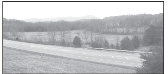
The eastern end of Cedar Grove's Clear Creek bottom land. This end was not as prone to being wet as was the western end. The re-aligned (1970) KY 52 in the foreground.