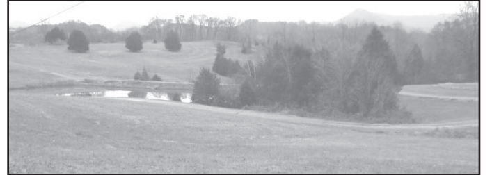
The upland portion of the Wilcox/Grover Cain Farm. This was used for grazing cattle and raising hay. The farm also had considerable river bottom acreage, just beyond the raised area, that was useful for raising corn.