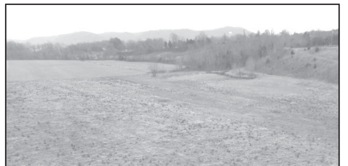
The Kentucky River bottomland of the McClanahan Farm looking toward West Irvine bottomland farms.