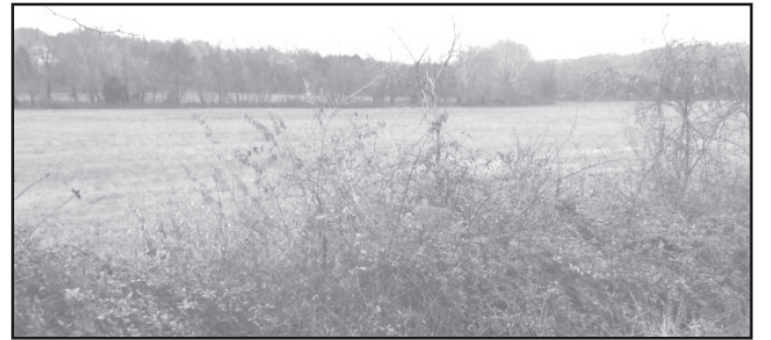
Typical Clear Creek farm land. This is on the Alexander farm, this was typically used for hay and some cattle grazing. Portions of the land was prone to wet conditions; difficult to raise row crops.