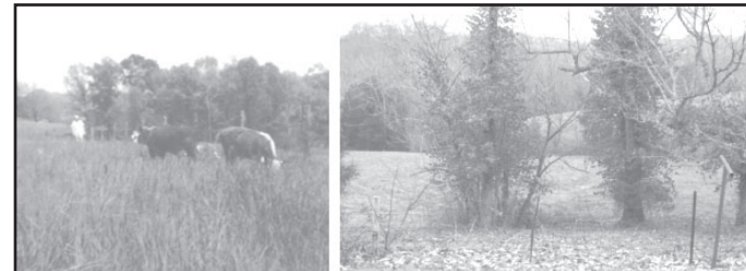
The Edgar Rose farm (left) where he raised early tomatoes, cattle, and sometimes tobacco. The Belle Trussell farm (right) behind the house; additional river bottom acreage is beyond the hilly cattle pastures where corn was normally raised.