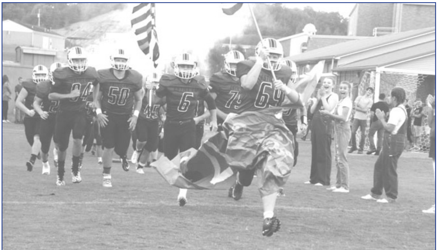
After a week of Homecoming festivities at the high school, the Engineers were full of energy as they took the field on Friday night to go up against the Bath County Wildcats.

Estill will travel to West Liberty to take on Morgan County this Friday night. Come out and support the Engineers. GO BIG BLUE!!!