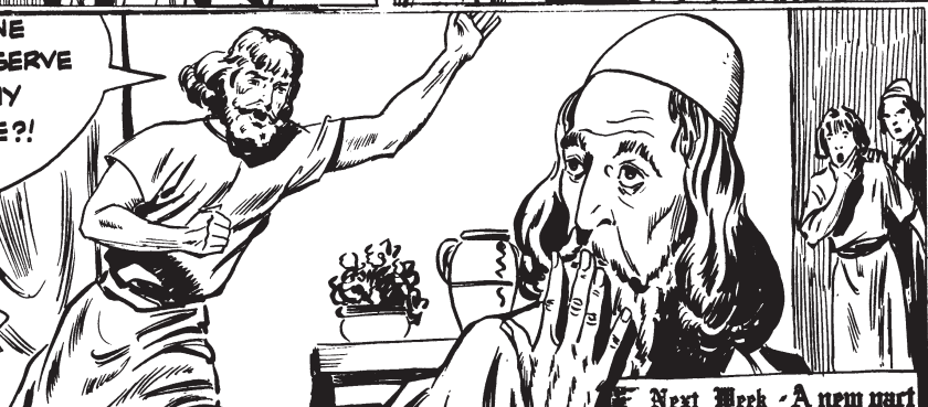
SAVE THIS FOR YOUR SUNDAY SCHOOL SCRAPBOOK

WHAT HAST THOU DONE UNTO ME?! DID I NOT SERVE THEE FOR RACHEL?! WHY HAST THOU TRICKED ME?!