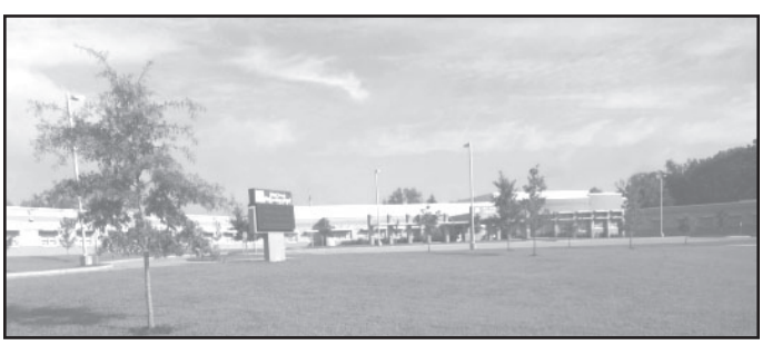
Recent view of the present and larger and more modern West Irvine School which opened about 2012.