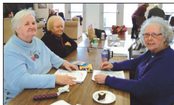
Senior citizens worked puzzles at the Estill Senior Citizens Center on Friday after playing Bingo while they were waiting for lunch to be served.