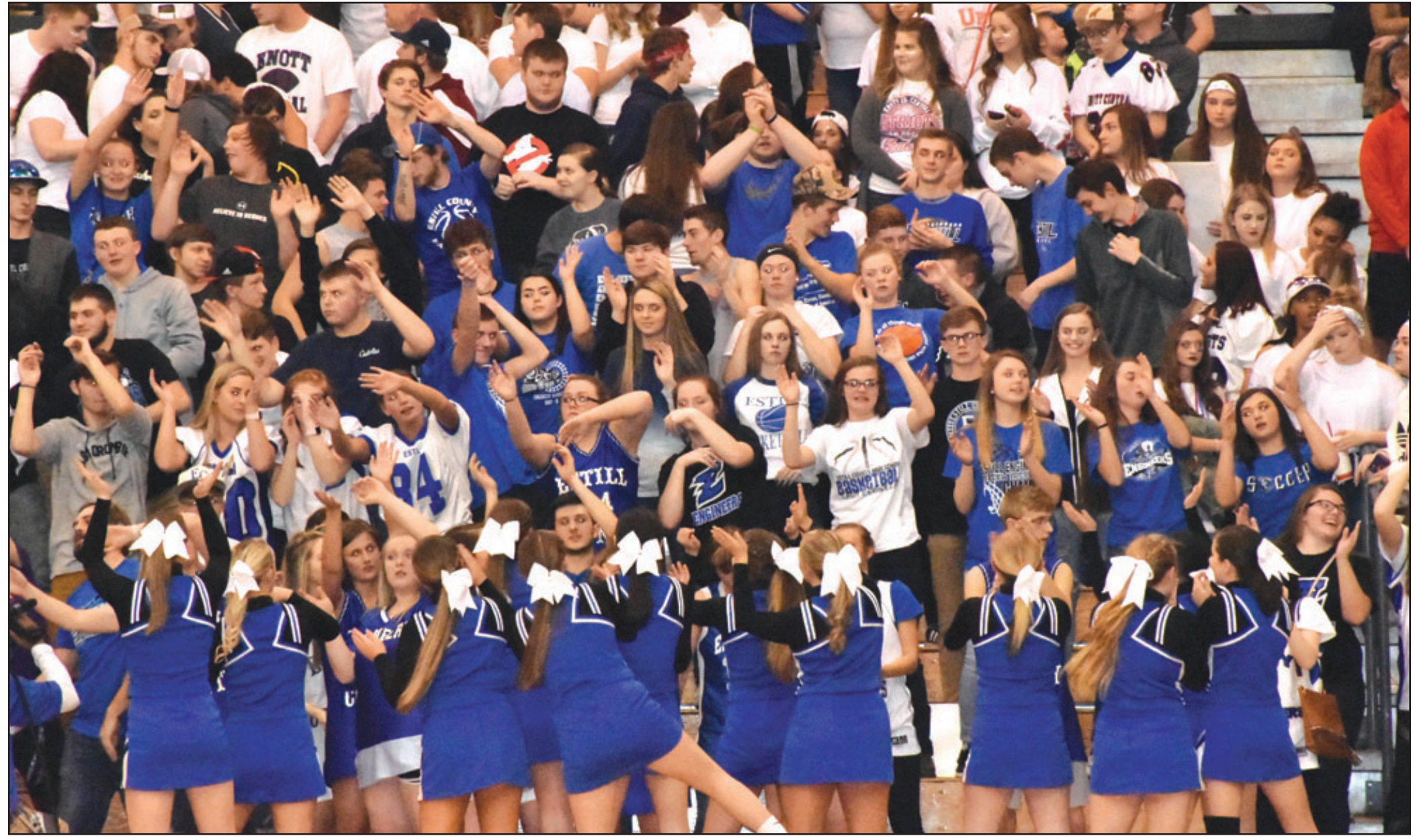
Estill Engineers fans do a wave during timeout on Monday at the 14th District Tournament.