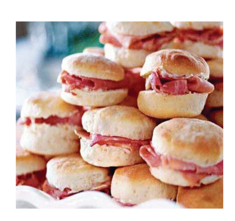
Free Ham and Biscuits While supplies last