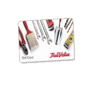
Free $25 Gift Card To the first five customers