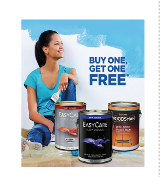
BOGO True Value Paint Some restrictions apply.