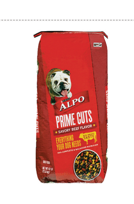
$18.99 Dog Food, Alpo Prime Cuts, 47 lb. 161096