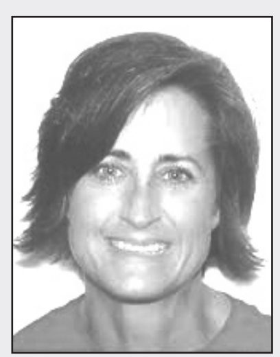
by Dawn Reed E. Ky. Columnist

whole new life may sound ex- and stayed where they were. citing on a Monday if you don't is a completely different thing!