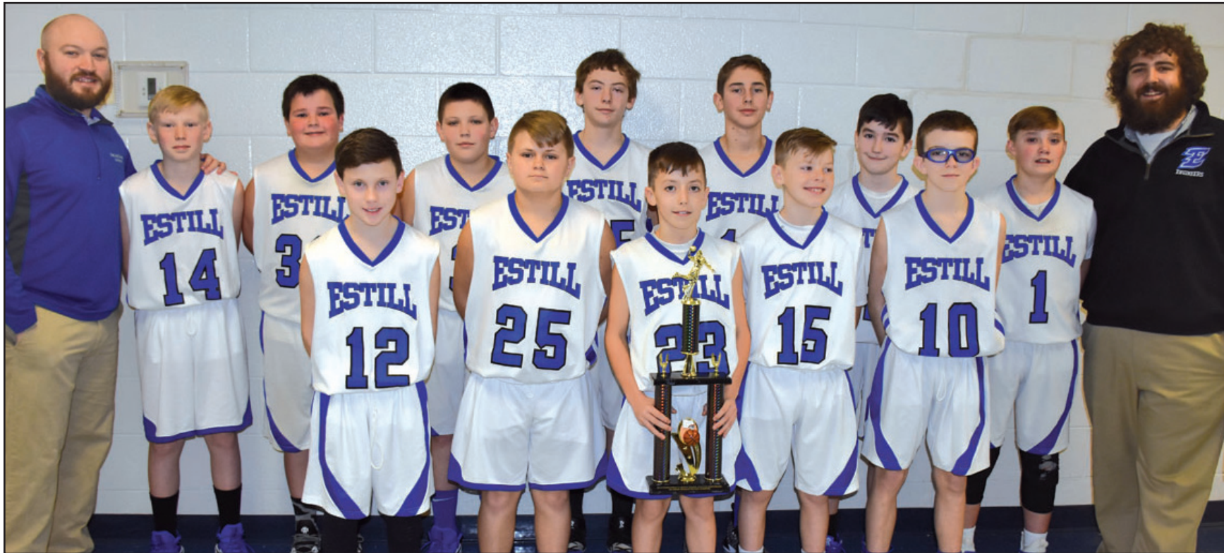
2019 Commonwealth Conference Season Champ & Tourney Runner-Up and 56th District Champion - ECMS Engineers