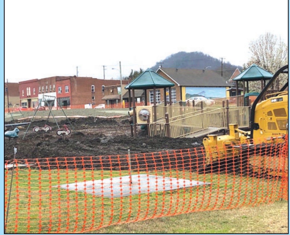
Veterans Memorial Park in Ravenna was closed last week so that contaminated soil could be removed by an environmental company hired by CSX Railroad. Work is continuing.