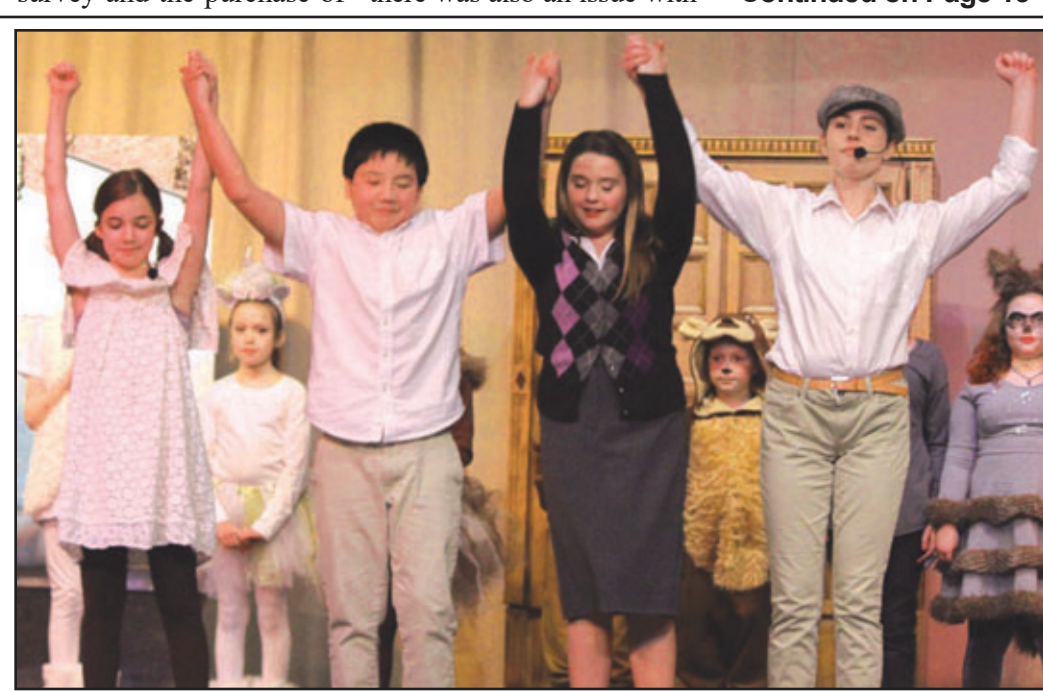
Top Photo: Child actors with River City Players take a bow after their first production of "The Lion, The Witch, and The Wardrobe." Right photo: One of the actors steps through the wardrobe which takes her to the land of Narnia, where they meet the witch and the lion. Two more productions are scheduled for this weekend, Friday at 6 and Sunday afternoon at 3.