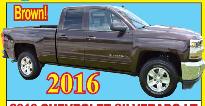
2016 CHEVROLET SILVERADO LT

2016 CHEVROLET TRAX LT LOADED! LEATHER! "DEEP EXPRESSO MAROON!" AWD! LOW MILES! WE HAVE FINANCING!