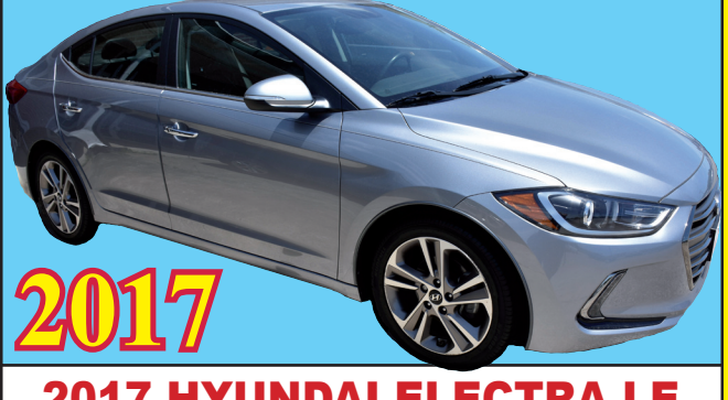
2017 HYUNDAI ELECTRA LE 4DR, LOADED! ONLY 15K MILES! LIMITED EDITION! FACTORY WARRANTY! WE HAVE FINANCING!

4-DR LT! LOCAL TRADE! ONLY 92 MILES! LOADED! SAME AS NEW! FACTORY WARRANTY! FINANCING!