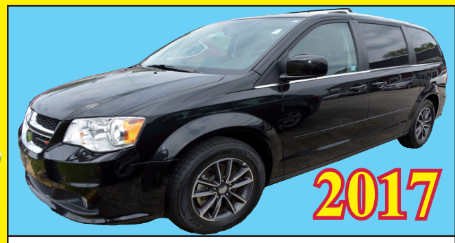
2017 DODGE GRAND CARAVAN LOADED WITH OPTIONS! CHECK THIS ONE OUT! FACTORY WARRANTY! WE HAVE FINANCING!

BLACK! 4-DOOR, 4X4! LOADED! ONLY 15,870 MILES! ONE-OWNER! FACTORY WARRANTY! FINANCING!