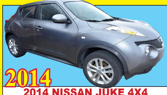
2014 NISSAN JÜKE 4X4 4-DOOR! LOADED! GOOD MILES! LOCAL TRADE! WE HAVE FINANCING!