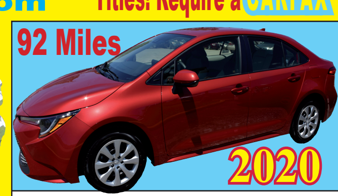
2020 TOYOTA COROLLA

BROWN! 4-DOOR AND LOADED! FACTORY WARRANTY! WE FINANCE!