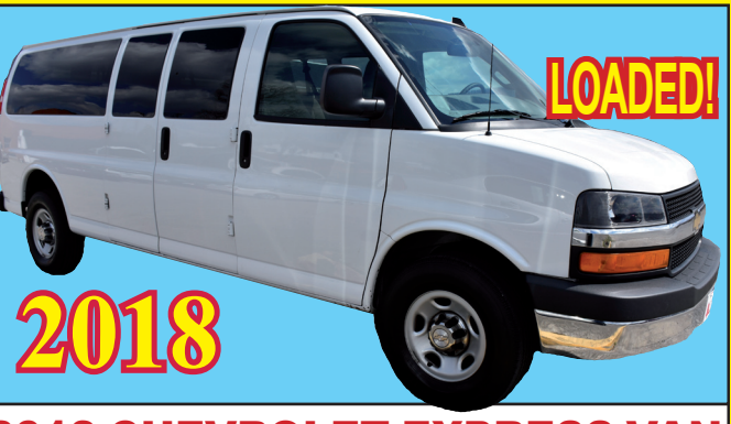
2018 CHEVROLET EXPRESS VAN DUAL HEAT & AIR! 15-PASSENGER! ONLY 24K MI!