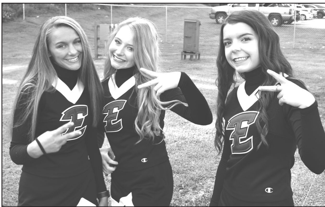
Estill cheerleaders get ready for the 2019 Engineers season