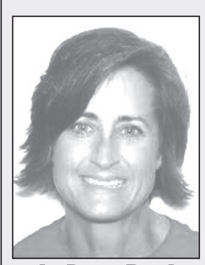
by Dawn Reed E. Ky. Columnist

As we approached, we could hand. Curious, we watched go! Whew and ptL! as she flipped out a hook and