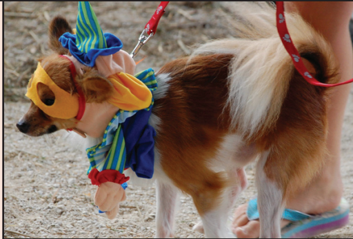
RIGHT: One of the 2010 Estill County's "well dressed" pets.